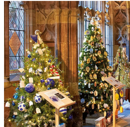
Christmas Trees at Worcester Cathedral 2020

Holland House , in Cropthorne have a full programme of events, including on-line events. Highlights for December include Quiet Days; Stations of Advent on line; roast dinners and meditation. Full programme and booking details on their website www.hollandhouse.org